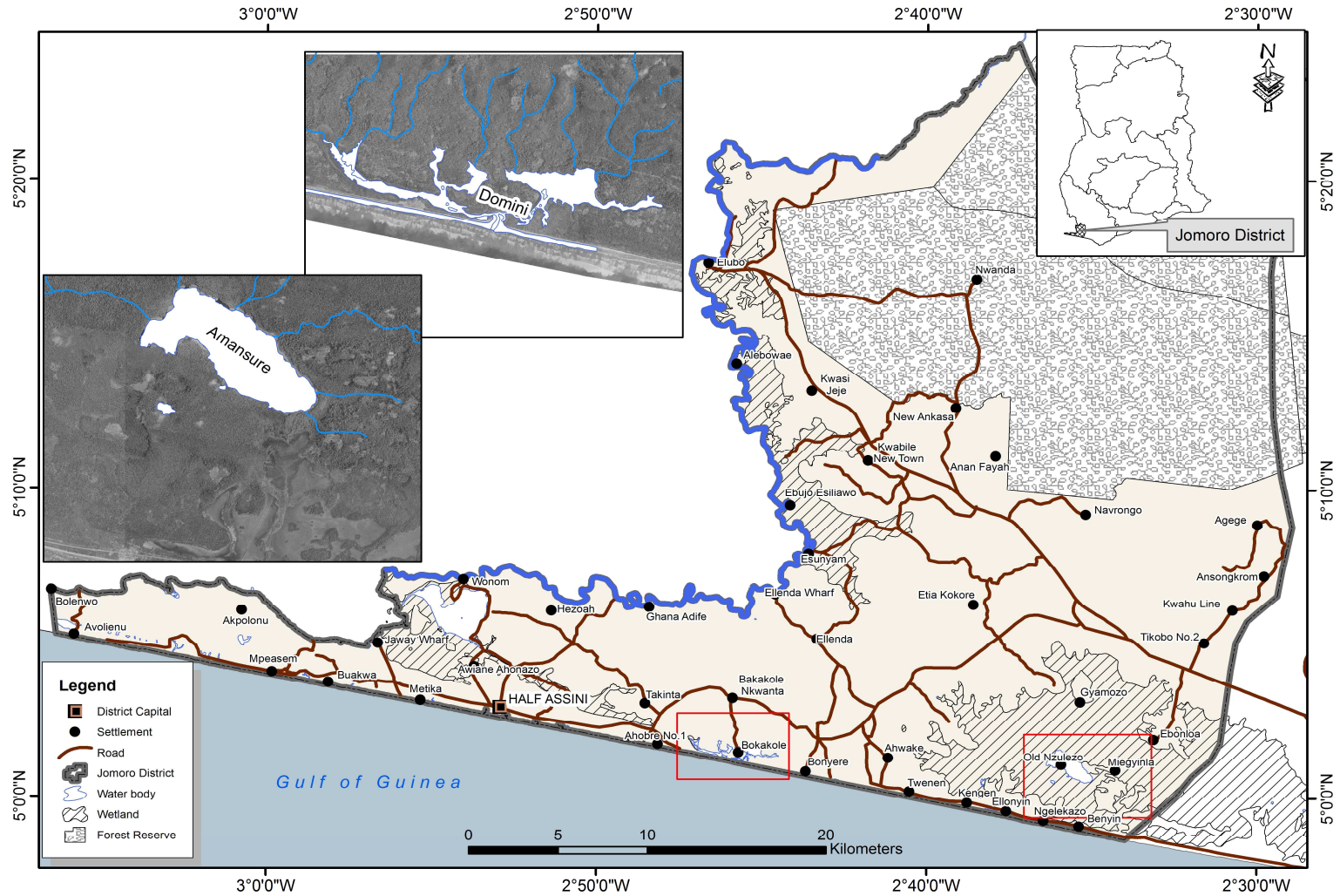
Figure 1: Map of Ghana showing the Amansuri and Domini Lagoons