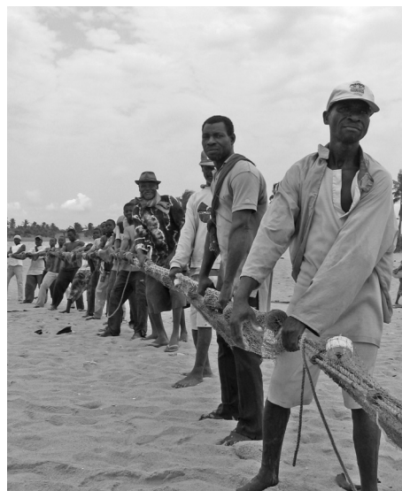
Photo three shows fifteen men pulling on the rope. With a large net there can be almost thirty or forty people pulling on each side. During the process, the two groups will gradually walk towards each other. This can take three to seven hours, depending on the number of ropes used (which also depends on the size of the net). Many crew members have a piece of cloth that they wind round the (wet) rope to protect their hands. As they pull, you can see their bodies hanging back, putting their full weight into the action. One day when I was helping pulling, the knot between