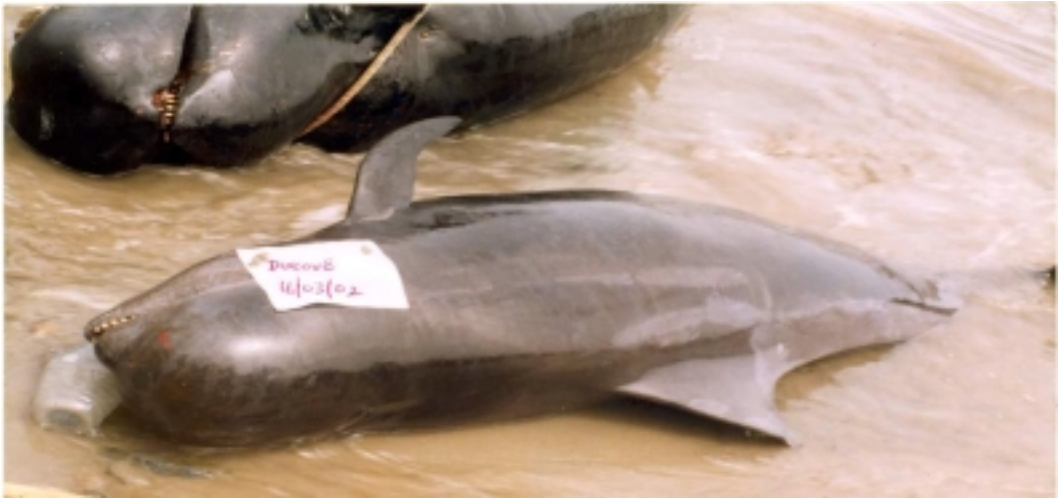
Fig. 12. A calf and an adult short-finned pilot whale, Globicephala macrorhynchus , hauled out at the Dixcove landing beach on 16 Mar 2002.

are irregular bycatch victims (3.5% of cetacean catches, Ofori-Danson et al. , 2003) in drift gillnets off Ghana and are sold for food. A significant conservation problem exists around the Canary Islands. Off Tenerife, damaged dorsal fins and backs, with deep wounds inflicted by small boat propellers, are very common, apparently the result of the carelessness of whale-watchers. In 1990 almost 10% of short-finned pilot whales were injured by boating (Heimlich-Boran, 1990; Carwardine, 1994; Van Waerebeek et al. , 2007).