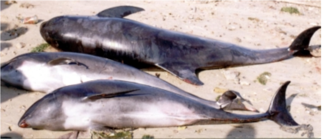
Fig. 10. Three melon-headed whales, Peponocephala electra , landed at Dixcove on 22 Jun 2000. The markedly triangular head-shape (in dorsal view), very pointed flippers, a slender tailstock, an indication of a very short beak (visible in the animal at the forefront) and a higher tooththrow count (20–25) distinguishes this species from the pygmy killer whale.

1981). Nonetheless, P. electra may be widely distributed in the eastern tropical Atlantic. Length at birth is reported as ca. 1 m (Jefferson & Barros, 1997), but the ‘122 cm’ calf from Shama showed 4–5 vertical creases on its flanks, suggestive of foetal folds as from a recent birth. Uncertainty exists though, whether standard length had been taken or body length had been overestimated, by measuring over the body curvature. The Shama female showed swollen mammary slits consistent with lactation, hence it seemed safe to conclude that a mother/calf pair was involved. Female sexual maturity is reached, on average, at 235 cm (Jefferson & Barros, 1997), but this does not account for possible geographic variation.