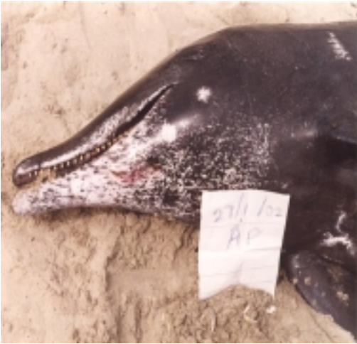
Fig. 8. A rough-toothed dolphin, Steno bredanensis , landed at Apam on 27 Jan 2002. The long-sloping head without melon crease, irregular ventral spotting and large flippers are indicative for this deep-water species.

reliable (W. F. Perrin, pers. comm. to Van Waerebeek).