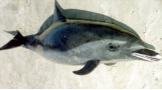
Fig. 5. A fresh pantropical spotted dolphin, Stenella attenuata , landed by Apam fishermen in 1998. Note the brilliant white lips and tip contrasting with an otherwise dark rostrum, the prominent dark cape dipping low onto sides forward of the dorsal fin, grey lateral and ventral fields (with moderate, white spotting), and smallish dark pectoral fins. The gape to flipper stripe is muted in this individual.

Southwest Fisheries Science Center, La Jolla, California, is considered a trusted source (William F. Perrin, pers. comm.). No records exist from the Atlantic coast of South Africa (Findlay et al. , 1992).