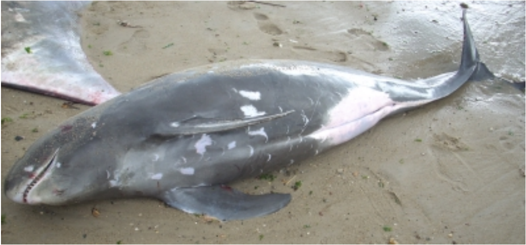
Fig. 11. This adult-sized pygmy killer whale, Feresa attenuata , landed at Dixcove beach on 31 Dec 2007 is the first authenticated record for the Gulf of Guinea. A low count of large, conical teeth and somewhat rounded flipper tips (visible here) sets this species apart from the morphologically similar melon-headed whale.

Short-finned pilot whale, Globicephala macrorhynchus