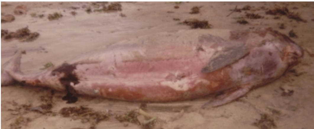
Fig. 16. A dwarf sperm whale, Kogia sima , landed as bycatch at Apam in 1998.

Earliest documented record. Apam fishermen brought ashore a 120-cm dwarf sperm whale calf on 23 Aug 1998 (Fig. 16), the first evidence of this species for Ghana and the Gulf. One of the authors, Debrah, collected the skull for the UOG collection. Despite physical immaturity of the specimen, cranial characteristics including tooth counts (LL9, LR9, UL5, UR5) firmly identify it as K. sima , the only Kogia species that may bear teeth in the upper jaw (Caldwell & Caldwell, 1989). In addition, the closely related pygmy sperm whale, K. breviceps , has more teeth (10–16 pairs) in the lower jaw.