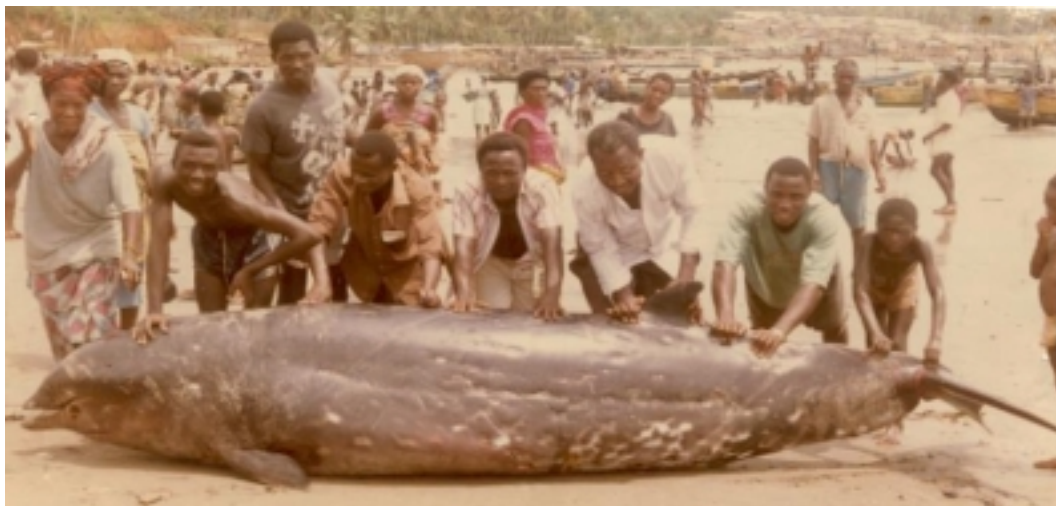
Fig. 15. A juvenile Cuvier's beaked whale, Ziphius cavirostris , landed at Axim in May 1994, the first record of a beaked whale in the Gulf of Guinea. Note the very short beak, the steeply sloped head, robust body and the dorsal fin located at 2/3 distance posteriorly. (Photo courtesy D. Vanderpuje).

Earliest documented record. A freshly captured, 3.2-m Cuvier's beaked whale of indeterminate sex was photographed by D. Vanderpuje at Axim landing beach in May 1994. The juvenile animal (based on its size) had no erupted teeth. Vanderpuje's photographs clearly illustrate the characteristic 'goosebeak' shape of the rostrum (Fig. 15). Tormosov et al. (1980)