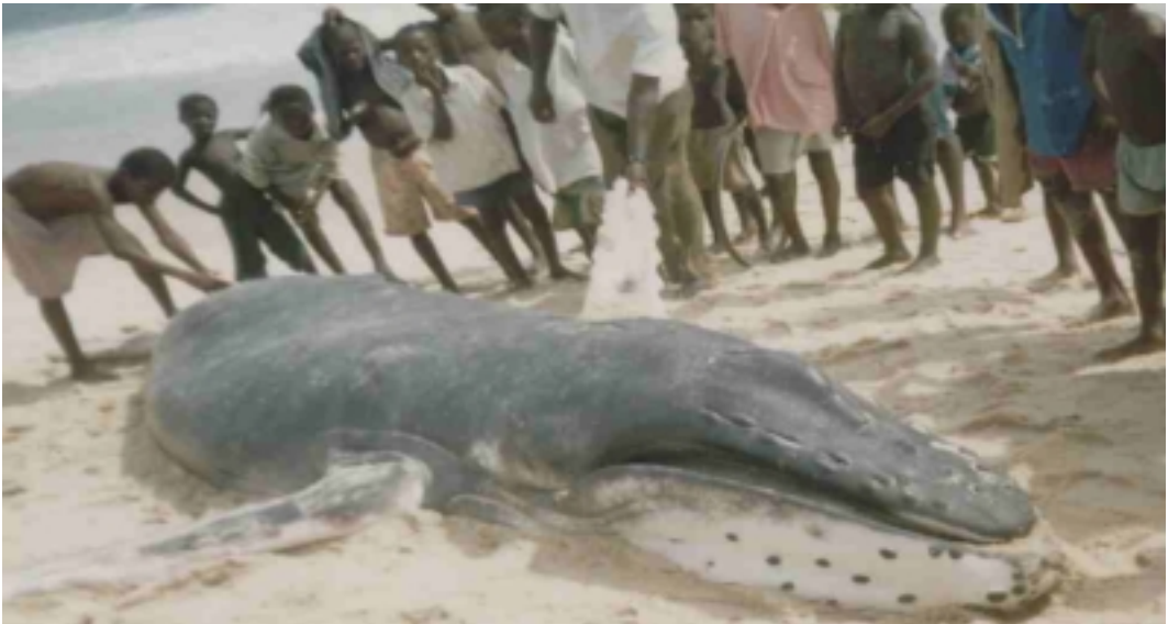
Fig. 18. An emaciated neonate humpback whale stranded at Ada, eastern Ghana, in Sept 1997. Photographed when freshly dead, it is unclear whether the animal died on the beach. Ghana's coast forms part of the distribution range of a 'Gulf of Guinea' breeding stock, whose calving seasonality and exclusive presence in austral winter months firmly points toward a Southern Hemisphere population.

Earliest documented records. Irvine (1947) recorded seeing a whale which looked like a humpback whale at Prampram in September 1938; however, the species was not authenticated until Van Waerebeek & Ofori-Danson (1999) presented a photo of a neonate (Fig. 18) stranded at Ada (05° 48.5' N, 00°38' E) in Sept 1997, photographed by a Ghana Wildlife Department officer. The emaciated calf showed no external trauma, and must have been either ill or unable to suckle. Another neonate stranded in Lomé, Togo, near the eastern border of Ghana, on 22 Aug 2005 (Tchiboza & Van Waerebeek, 2007). The neonates, both very fresh (condition 2) when photographed, may have stranded alive. It is unknown whether the carcasses were