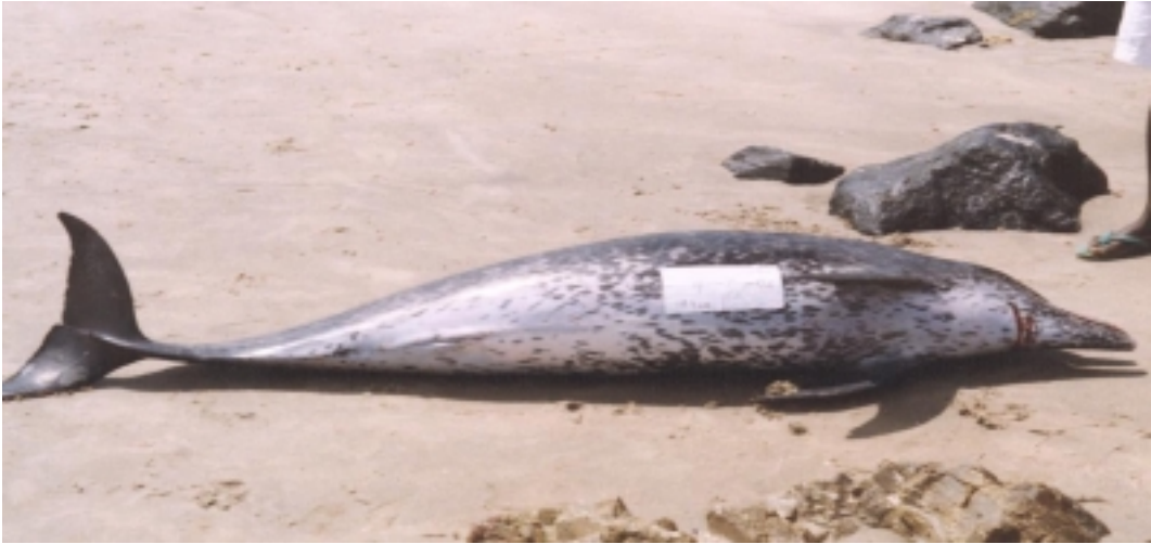
Fig. 6. Atlantic spotted dolphin, Stenella frontalis , offered for sale on Dixcove's landing beach on 3 Jan 2003. Large black spots on a white ventral field and a sturdy, middle-sized rostrum are characteristic.

and western tropical Atlantic (Perrin et al. , 1987). A 188-cm male and a 200-cm female were taken off Vridi, La Côte d'Ivoire, on 28 Feb and 7 March 1958, respectively (Cadenat & Lassarat, 1959; see Fig. 34–37 in Cadenat, 1959). In Benin's coastal waters, a group of 10 individuals was sighted, including heavily spotted adults with stocky bodies and big dorsal fins, and unspotted juveniles (Van Waerebeek, 2003). Rice (1998) included Gabon as range state, however, without mentioning his source. Farther south, S. frontalis is reported from sightings off Angola (Weir, 2008), but the species avoids the cold Benguela Current off Namibia and western South Africa (Findlay et al. , 1992).