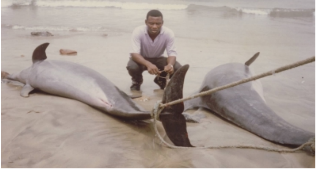
Fig. 2. Two common bottlenose dolphins, Tursiops truncatus , pulled up the beach by artisanal fishermen at Jamestown, near Accra, on 5 Feb 1994.

humerus and ulna, several teeth and a tissue sample (in DMSO) were collected. A second and a third common bottlenose dolphin, of 255 cm and 315 cm length, were brought ashore at Senya Beraku (05° 23' N, 00° 29' W) and Tema, respectively. These dolphins were previously reported but equivocally assigned to Delphinus delphis (Ofori-Danson & Odei, 1997). A calvaria dredged by a fishing boat from an indeterminate site in Ghana's shelf waters, collected by Dr Ofori-Adu sometime before 1998, was identified by KVV at the Tema Research and Utilization Branch of the Fisheries Department (Ministry of Agriculture).