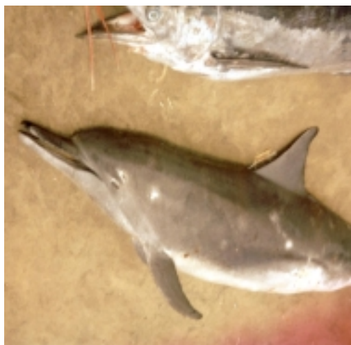
Fig. 4. Pantropical spinner dolphin, Stenella longirostris longirostris , encountered at Axim in 2000. Diagnostic characters include the very elongated rostrum, dark-tipped dorsally, triangular and pointed dorsal fin, small flippers and the three-partite patterned body (dark cape, grey lateral field, white ventral field).

Earliest documented records. OD collected the heads of two spinner dolphins landed at Dixcove, a cranially mature 197-cm individual (DOF 20/01; 19 June 2000) and a 190-cm specimen (DOF 20/038; 26 Oct 2000). Third and fourth specimens were sampled (DOF 20/028 and DOF 20/004, Fig. 4) at Axim on 8 Nov 2000 and on an