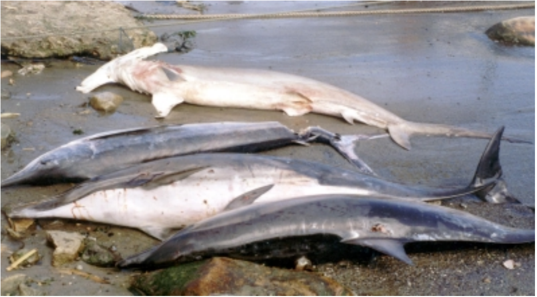
Fig. 7. Two long-beaked common dolphins, Delphinus capensis , landed alongside a smooth hammerhead shark and an unidentified billfish (Istiophoridae) at Dixcove, on 18 Oct 1999. Note the harpoon/lance entry wound at the right side under the dorsal fin of the (lower) dolphin.

(Heyning & Perrin, 1994; Jefferson & Van Waerebeek, 2002 ).