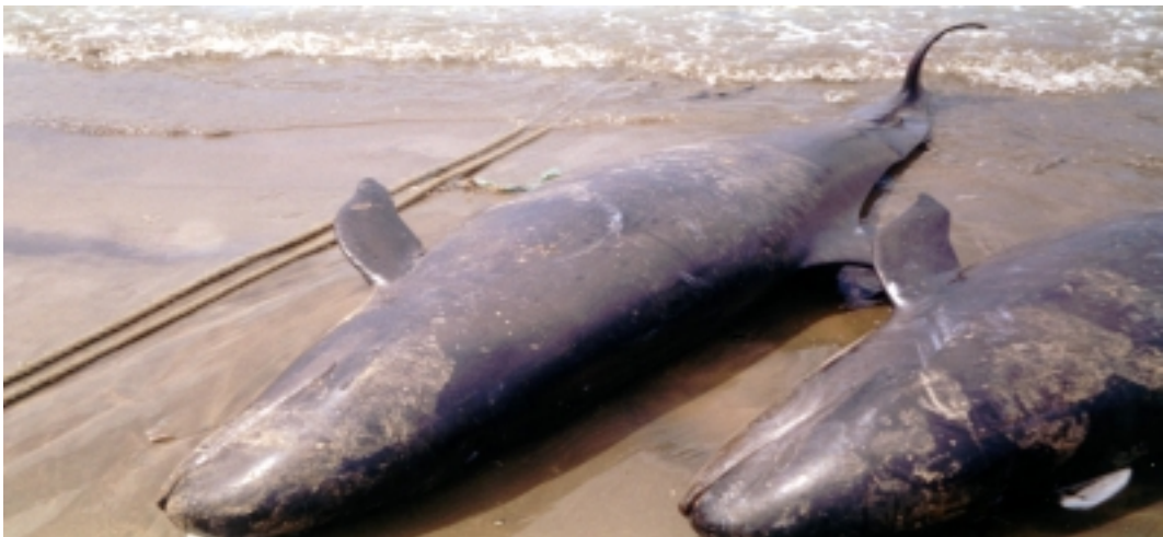
Fig. 14. Two false killer whales, Pseudorca crassidens , landed at Apam in 2003. Combined, the rounded head, almost entirely black colouration, curved flipper shape and the dorsal fin positioned slightly behind mid-back are diagnostic.

Earliest documented records. Three false killer whales were landed as bycatch at Apam, i.e. two adults on an unspecified date in 2003 (Fig. 14) and a 197-cm juvenile (photo archived) on 24 Sept 2003. The species’ presence in Ghana is here documented for the first time.