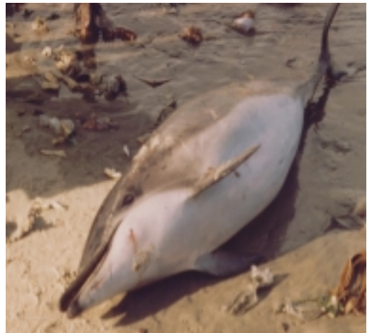
Fig. 3. The Clymene dolphin, Stenella clymene , is the most frequently landed cetacean in Ghana. Shown here is a freshly dead specimen, captured off Winneba.

Clymene dolphin, sometimes calling it the 'true dolphin' or 'Etsui Papa' because the species is so frequently found entangled in fishing gear. A probable bycatch specimen from Keta (05° 55' N, 00° 59' E) in May 1956 (Prof. Chris Gordon, pers. communication) is the earliest specimen record in the Gulf. The physically mature skeleton is mounted (without number) in the Zoology Department museum at UOG (alveoli counts, 41UL, 42 LL). A second specimen, a 216-cm female, with sharply pointed teeth (38UL, 39LL), was captured off Winneba on 23 September 1998 (Fig. 3). The tripartite body colouration, including a white belly, black eye patch, grey eye-to-flipper stripe, a characteristic dark stripe along the middle of the upper rostrum ending in a black rostrum tip, and fine blackish lip patches were evident (Perrin et al. , 1981). A third, juvenile, specimen (99/03) was landed at Apam on 20 July 1999 (its head was shown as Plate B in Ofori-Danson et al. , 2003). No helminth parasites were found