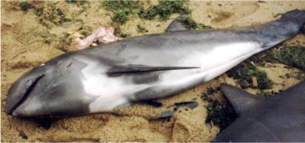
Fig. 9. Risso's dolphin, Grampus griseus , calf at the Dixcove landing beach on 16 Jun 2000. Its flukes had been severed before landing and it was cut in four pieces and sold on the spot.

head and tall, pointed dorsal fin. The species almost certainly occurs throughout the Gulf, but Ghana and La Côte d'Ivoire are the only confirmed range states. The latter record was associated with a SST of 23.5 °C (Cadenat, 1959). However, the eurythermal G. griseus inhabits tropical to cool-temperate waters, which is in concordance with its presence also off Angola (Weir, 2007), Namibia and South Africa, where it is associated with the shelf edge and pelagic waters (Findlay et al. , 1992). The forestomach of one specimen (from Axim, 2 Nov 2000) contained at least six anisakid nematodes.