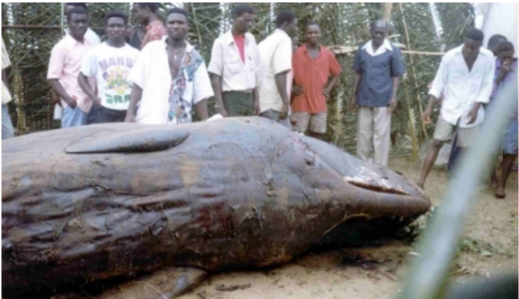
Fig. 17. A sperm whale, Physeter macrocephalus , stranded at Accra in Jul 1997 is the focus of a customary burial ceremony performed by local fishermen. Several (but not all) coastal communities in Ghana, Togo and Benin traditionally venerate whales and other cetaceans.

Distribution and natural history. Little scientific information is available for the Gulf of Guinea; however, females and juveniles are thought to be present year-round beyond