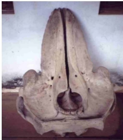
Fig. 13. Skull of a killer whale, Orcinus orca , from an unspecified location in Ghana, curated (without catalogue number) at the University of Ghana, Legon. In dorsal view, the concave lateral border-line of the premaxillaries allows a quick differentiation from the straight and parallel premaxillaries in Pseudorca crassidens . In ventral view, teeth and alveoli are diagnostic.

Earliest documented record. The skull (without catalogue number) of an adult killer whale is held at the Zoology Department, UOG (Fig. 13). According to the curator it has been in the collection for many years, and was collected at an unknown location in Ghana, possibly in 1956. Teeth and corresponding alveoli are oval in cross-section (diagnostic) versus circular as in Pseudorca crassidens .