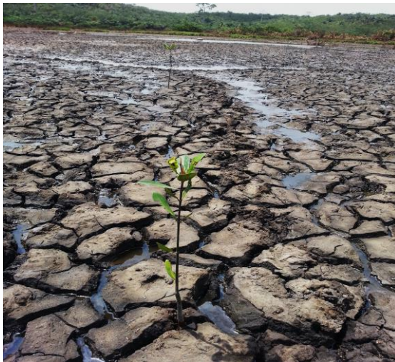
Fig 3.2.2 Replanted mangroves in 2015