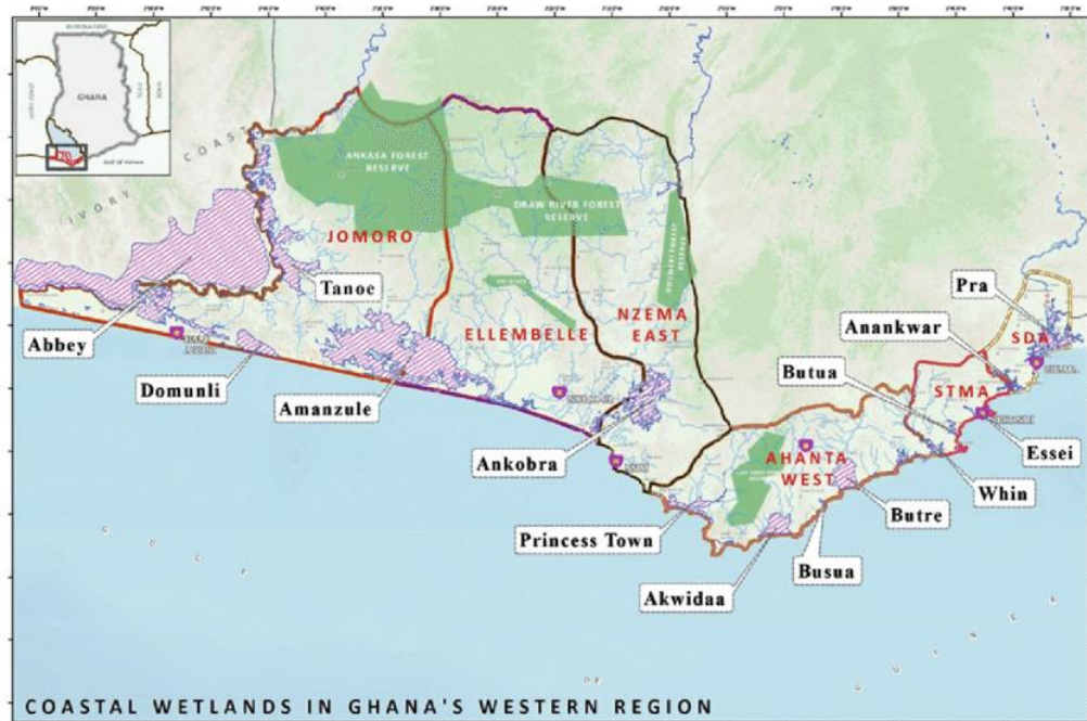
Figure 1.1 Map of Western region showing major wetlands

Mangrove forests and wetlands are abundant resources in the six coastal districts of western region of Ghana. Major mangrove forest and wetlands areas include Pra Estuary and associated wetlands in Shama District, Esse -Whim wetlands in Sekondi-Takoradi Metropolitan Area, Butre -Akwidai wetlands in Ahanta West district and Greater Amanzule Wetlands ( GAW) that stretches through Nzema East , Ellembelle, and Jomoro Districts. These areas are perceived as wastelands and all kinds of human activities have taken place at these natural sites. Human behavior and activities include reclamation for oil /gas expansion projects, human settlement indiscriminate cuttings of mangrove forest as fuel wood and as waste dumping sites especially plastic waste.