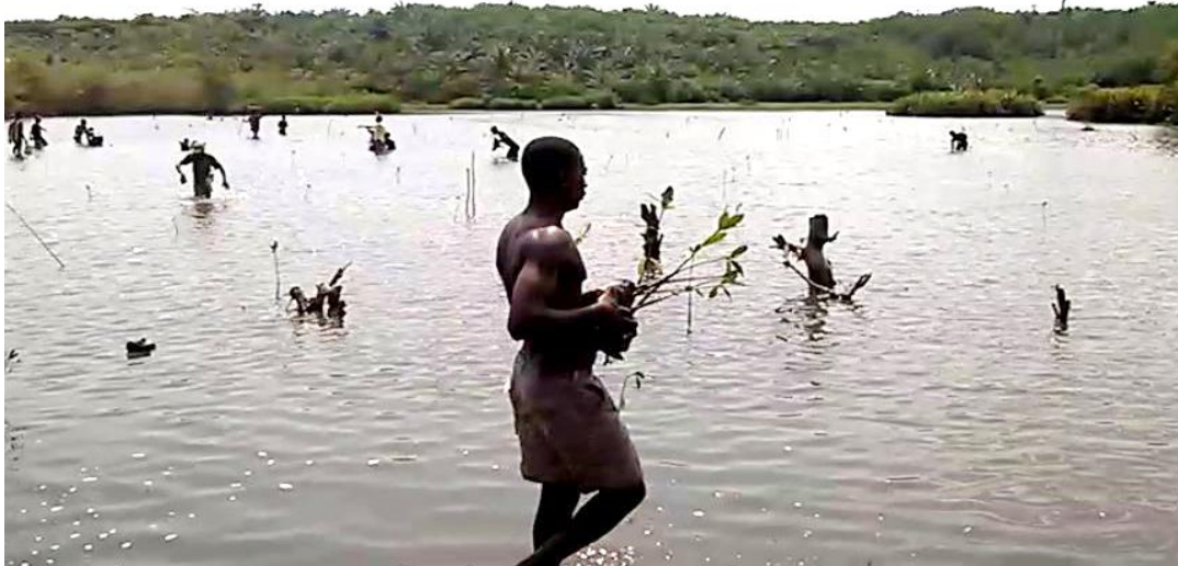
Fig 3.2.1 Replanting Mangroves at Yabiw in 2015