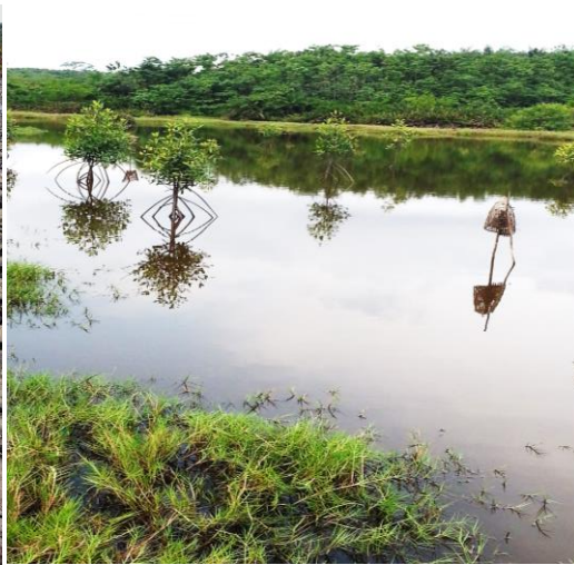
Fig 3.3.3 Replanted mangroves in 2018