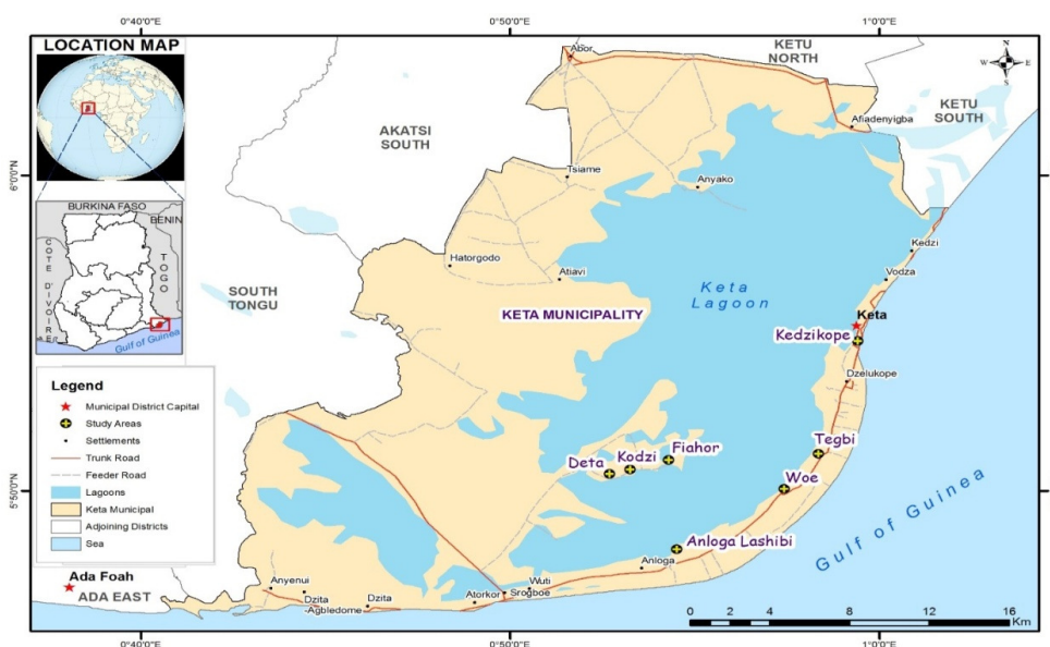
Fig. 1. Shows the areas around the Lagoon where the study was undertaken Fig. 1. Study area